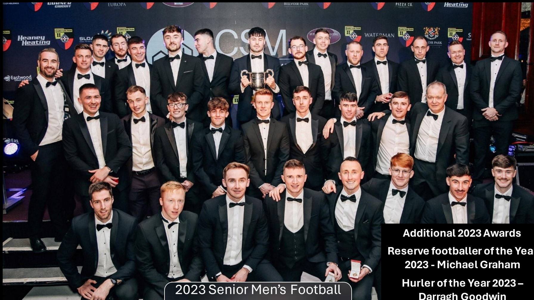
2023 Senior Men's Football Team and Management Down Division 1 winners