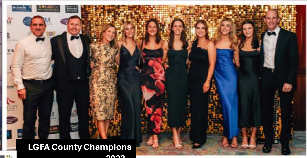
LGFA County Champions 2023 – Carryduff Junior Ladies and Management