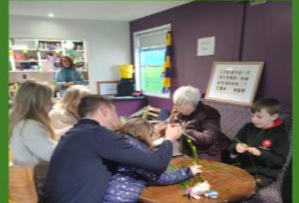
St Brigid's cross-making