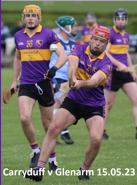
Carryduff v Glenarm 15.05.23