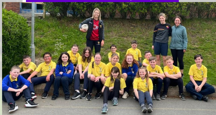
Millennium Primary School pupils

We are delighted to be able to reach out to many children who may not otherwise have had this opportunity.